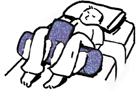
Fig 1: T-Roll